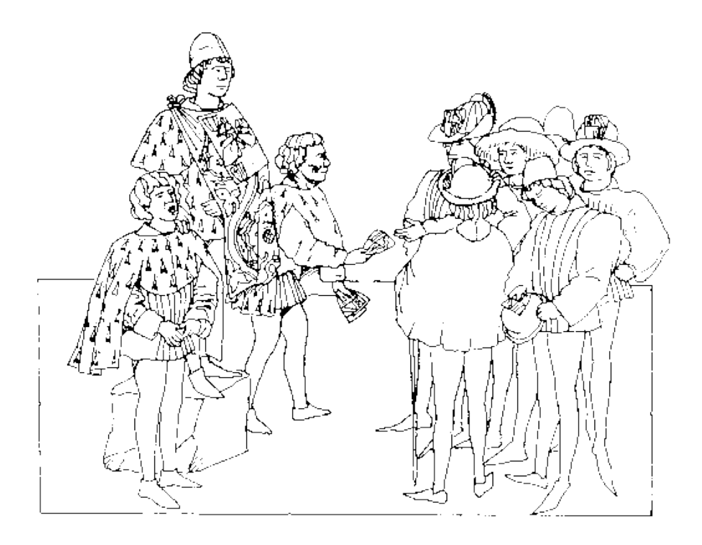
Figure 1: Heralds in Matching Tabards, from Rene' of Anjou's Tournament Book

Several other examples can be seen of heralds in the service of the same monarch wearing matching tabards. Figure 2 shows a procession of the English Officers of Arms. Their tabards all bear the same emblazon.