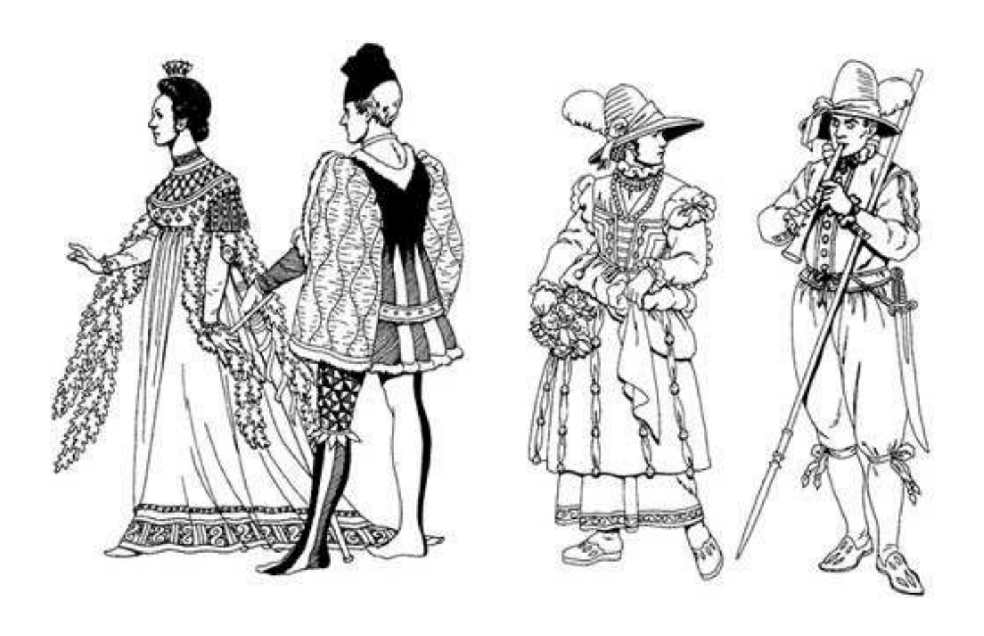
Page 12 – Free weekly sampler of clip art from Dover Publications

Page 9 – Detail from Triton's official seal, courtesy of Master Bran Trefonnen